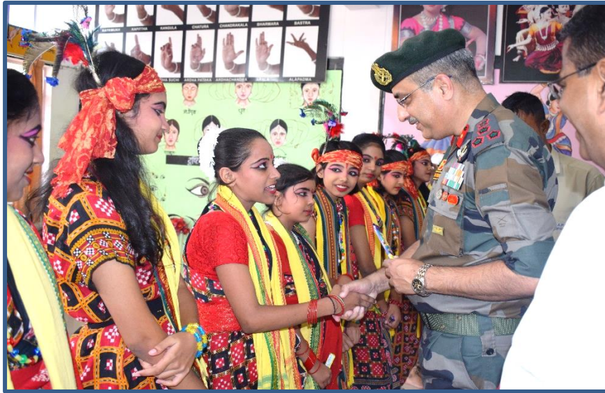
Chocolate Day Celebration: The school celebrated National Chocolate Day of U.N.O. on 28 Oct 2022. Awareness about Chocolates including their Ingredients, Manufacturing, and Consumption followed by Q/A Session marked the day.