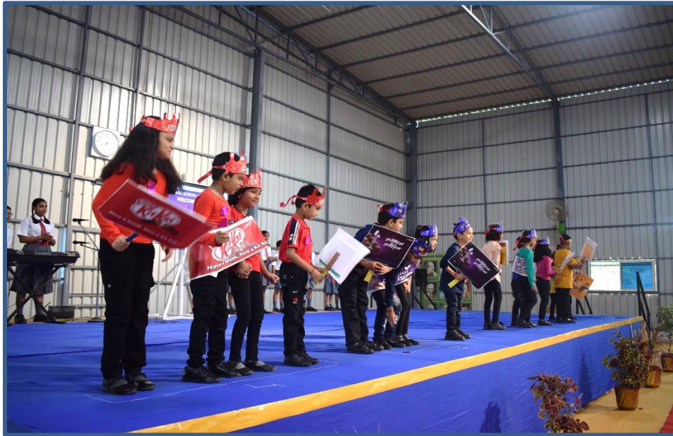
Mock Parliament: The school organized Mock Parliament on 22 Oct 2022.